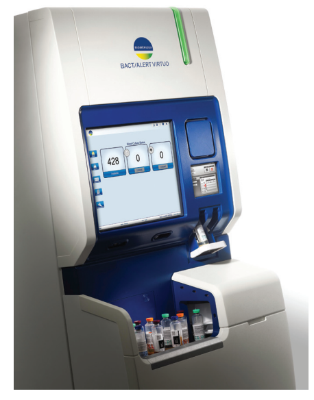
BACT/ALERT VIRTUO can be placed outside the lab and loaded by any staff member.

Previously, time to detection was about four hours longer for samples collected between 8pm and 8am compared with daytime samples, due to delayed entry. "ER doctors appreciate quicker blood culture results," says Chan. "With