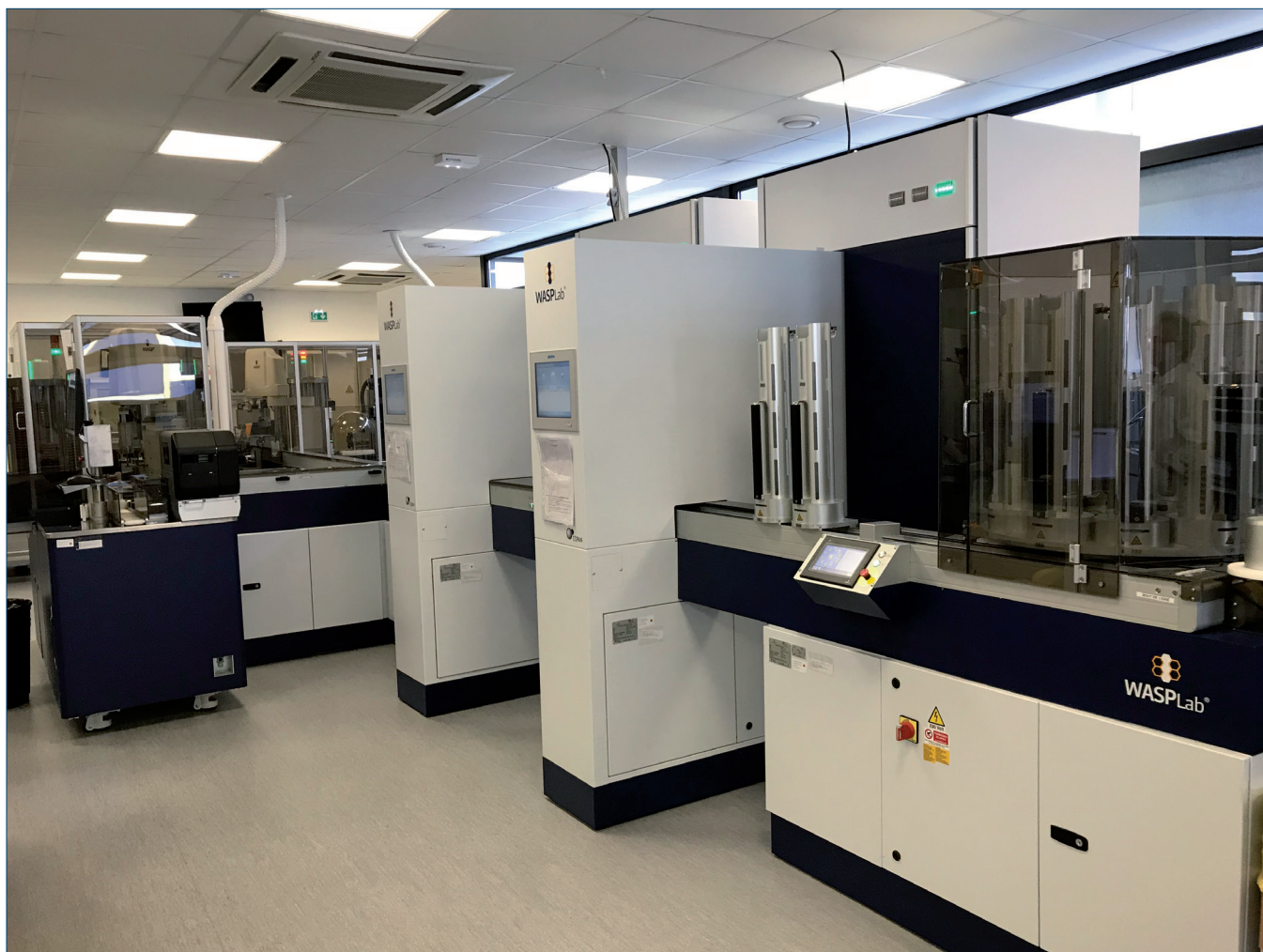
La solution WASPLab® au laboratoire LABOSUD