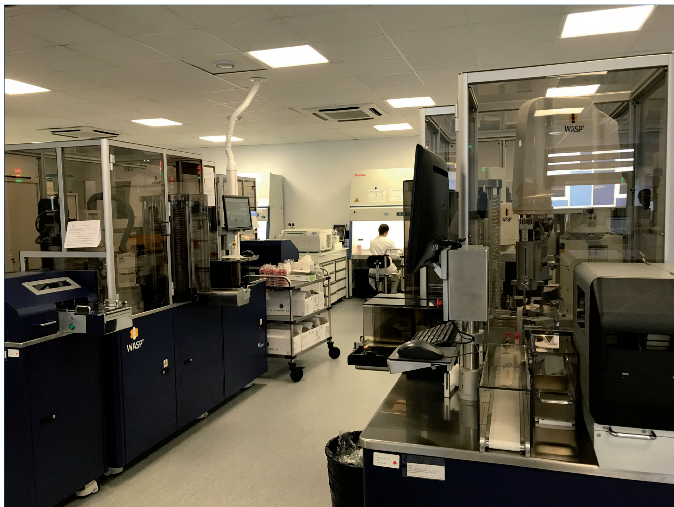
La solution WASPLab® au laboratoire LABOSUD